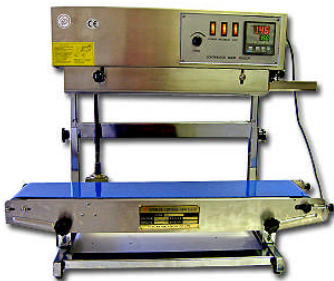
CBS-880II (CBS-880II includes a vertical converting kit)