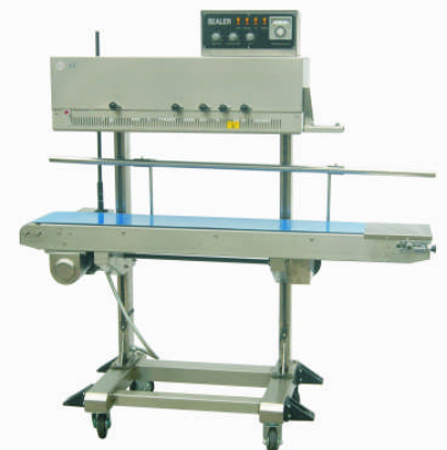
FRM-1120AL/D (The vertical conveyor does not tilt. The sealing head moves up & down)

Some machines and/or options are special order and can take 8-12 weeks to come in. Distributed by: Doug Care Equipment 559-539-3076 doug@dougcare.com